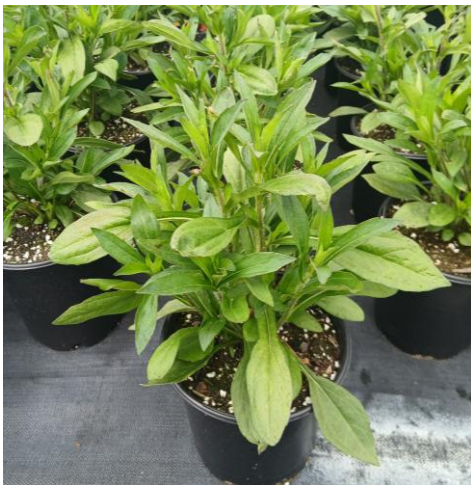
Rudbeckia fulgida var. fulgida 1G