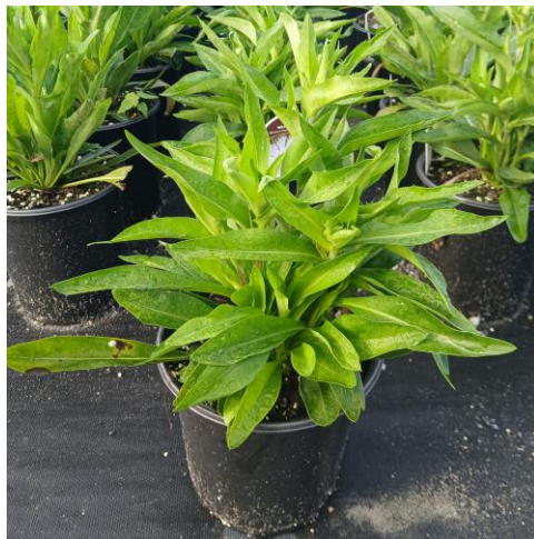
Stokesia laevis Mels Blue 1G