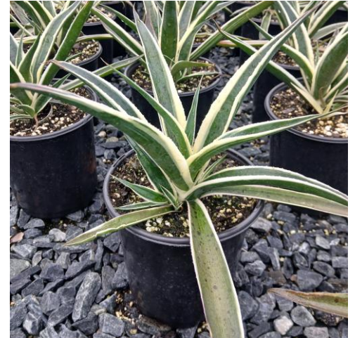
Mangave Snow Leopard 1G