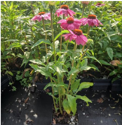
Echinacea purpurea PowWow Wild Berry 1Q