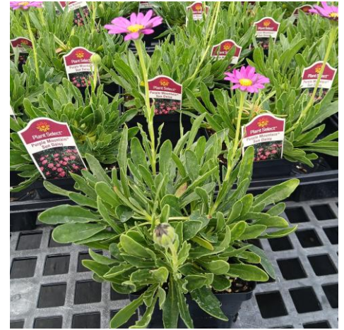
Osteospermum ecklonis Purple Mountain 1Q