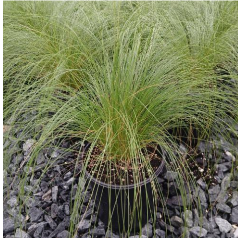
Stipa tenuissima Pony Tails 1G