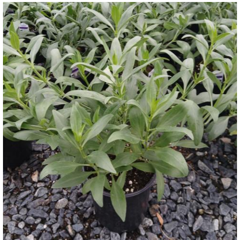
Centranthus ruber Alba 1G