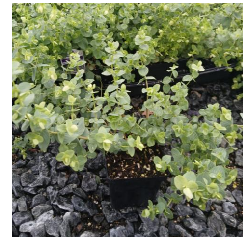
Origanum x Kent Beauty 3.25