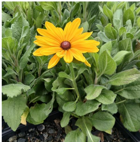
Rudbeckia hirta Indian Summer 1Q