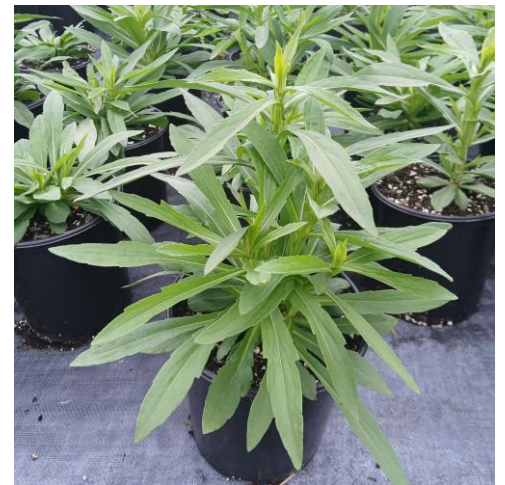
Helenium autumnale 1G