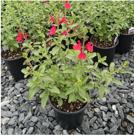
Salvia greggii Radio Red 1G