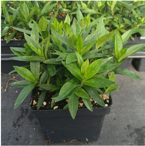
Phlox divaricata May Breeze 1Q