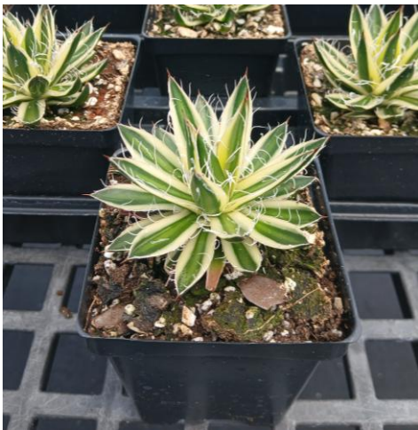
Agave schidigera Black Widow 3.25"