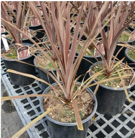
Cordyline australis Red Star 1G