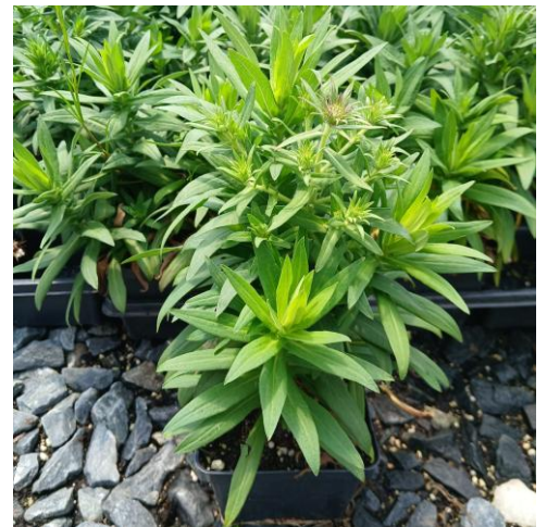
Aster novae-angliae Purple Dome 1Q