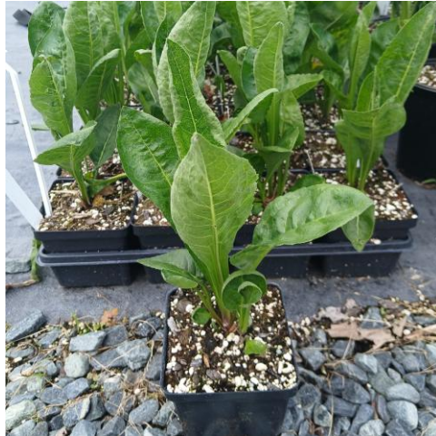
Aster tataricus 1Q